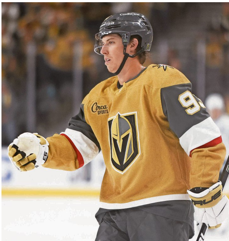
Mitch Marner's arrival will help the Vegas Golden Knights and his absence will hurt the Toronto Maple Leafs.

• The Colorado Avalanche got captain Gabriel Landeskog back during the