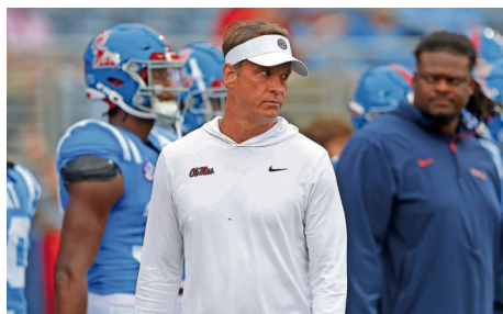
Ole Mississippi coach Lane Kiffin has led the Rebels to a 5-0 start that bodes well for their College Football Playoff credentials.

After reaching and winning the Birmingham Bowl last season, Vanderbilt